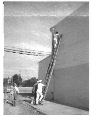
Darrel and others from Yukon paint outside of NuWay building