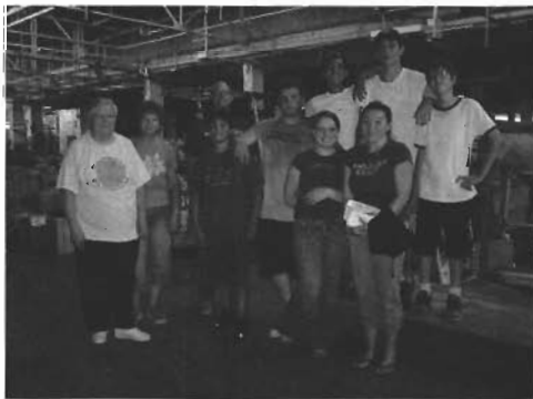
Woodward Church Team after a long day of work (and fun!)