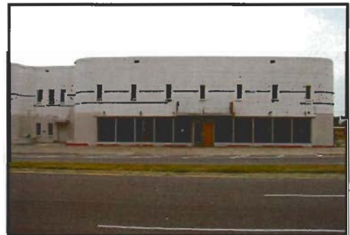
Love Link Thrift Store at NuWay